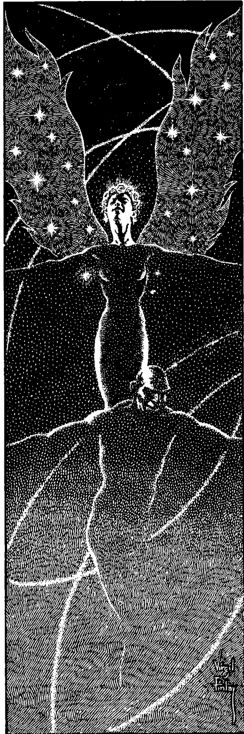
The Goddess screamed to them, and they came alive . . .

The willowy, bending figure swooped forward, trailing shadows. Out of the