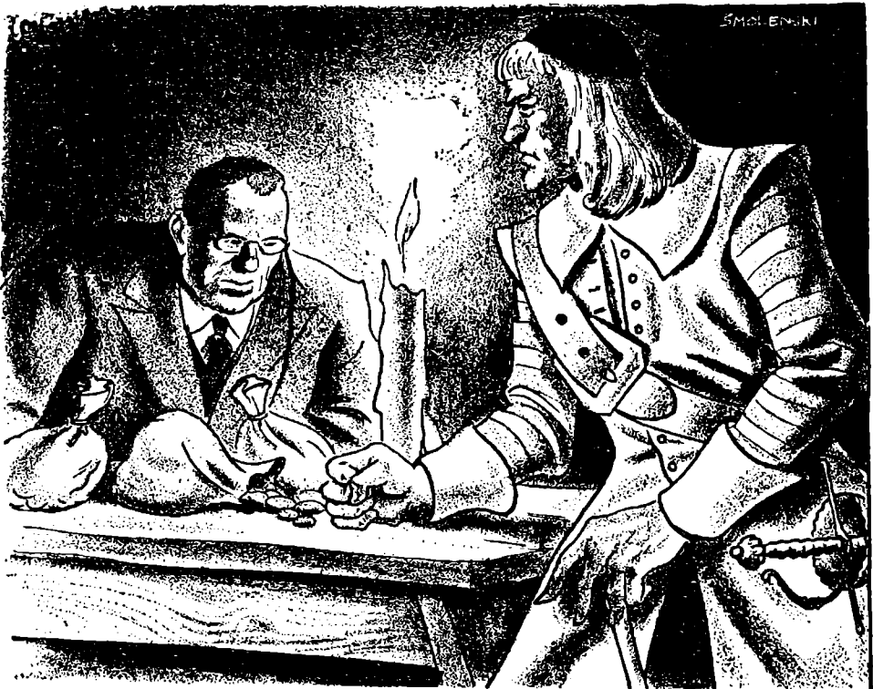
A bargain was struck with Peter Stuyvesant.

"Come, then." He shoved us before him, down the corridor to the