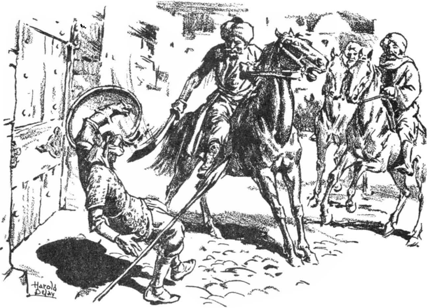
His scimitar gleamed and fell, and the soldier crumpled, cut through helmet and head.

again, it will be with spears and horsemen, to seize ye in my hands!"