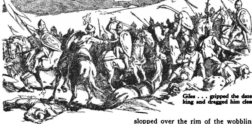
Giles . . . gripped the dazed king and dragged him clear.

THE clank of the sour sentinels on the turrets, the gusty uproar of the Spring winds, were not heard by those who revelled in the cellar of Godfrey de Courtenay's castle; and the noise these revellers made was bottled up deafeningly within the massive walls.