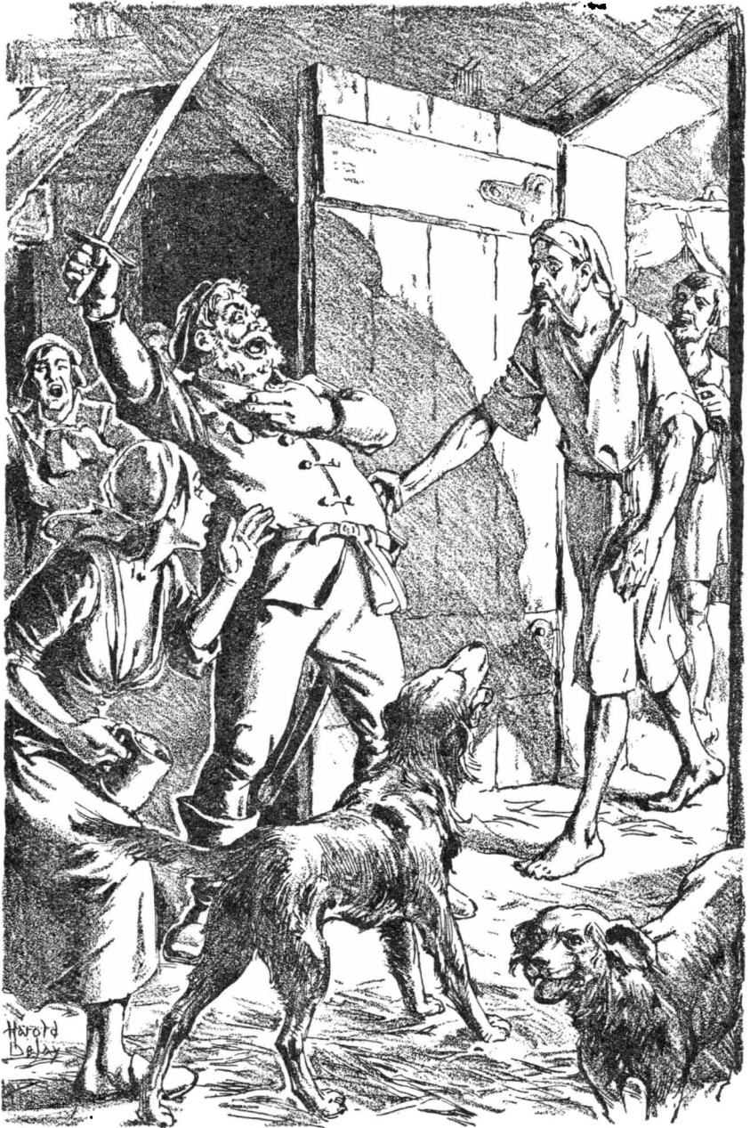
This fat man was bawling, "Succor, Sir Guiscard, succor! The castle is forced—"