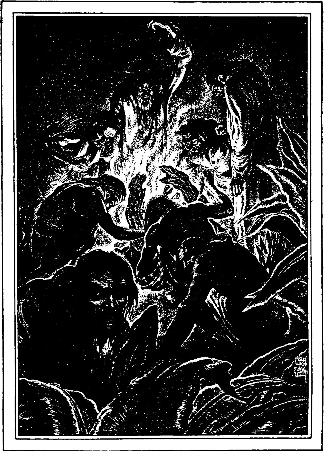
The men around the tiger's carcass resembled ghouls at a graveyard feast of flesh.