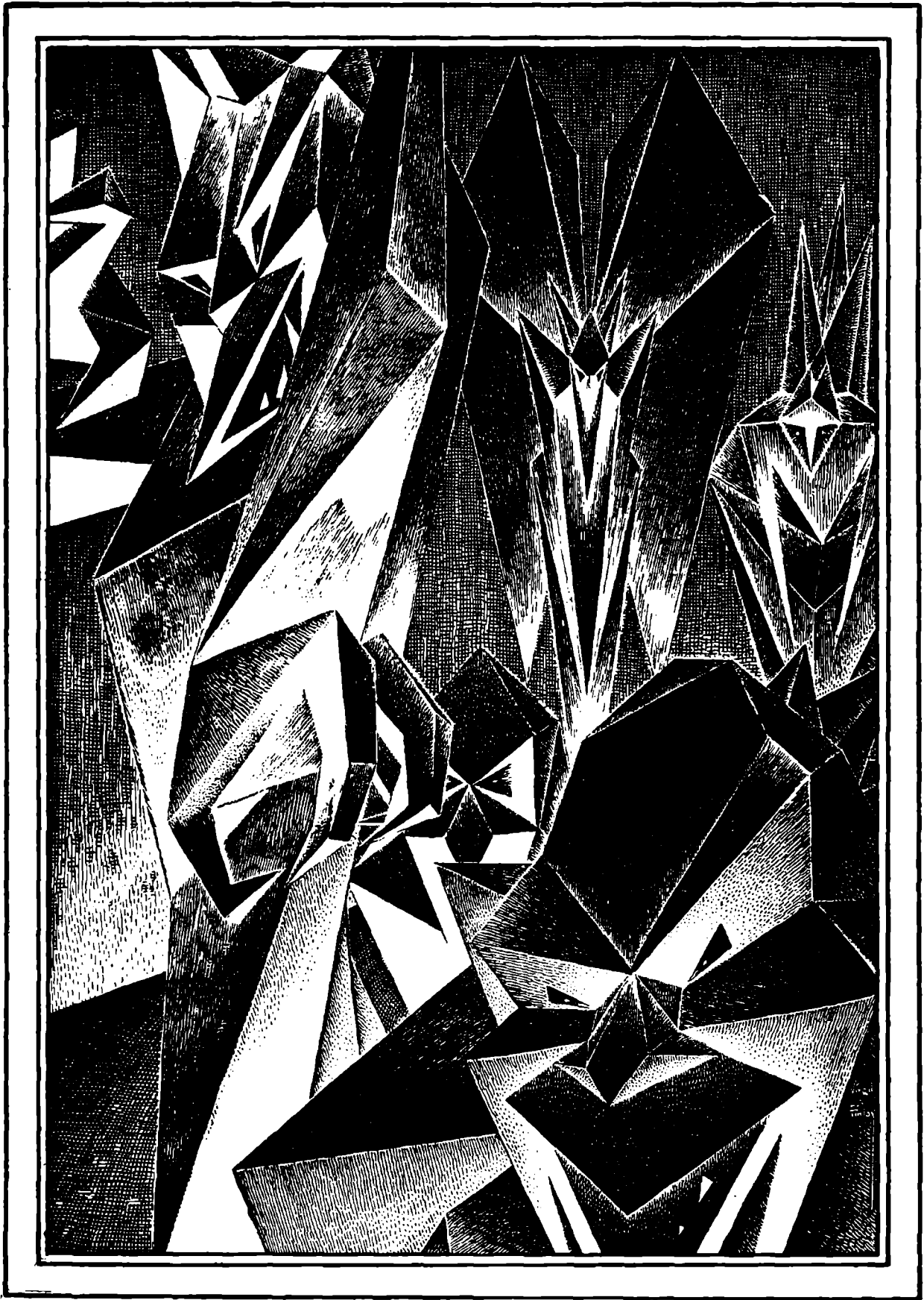
The golden objects were as weirdly shaped as the most fantastic designs of a Futurist sculptor.