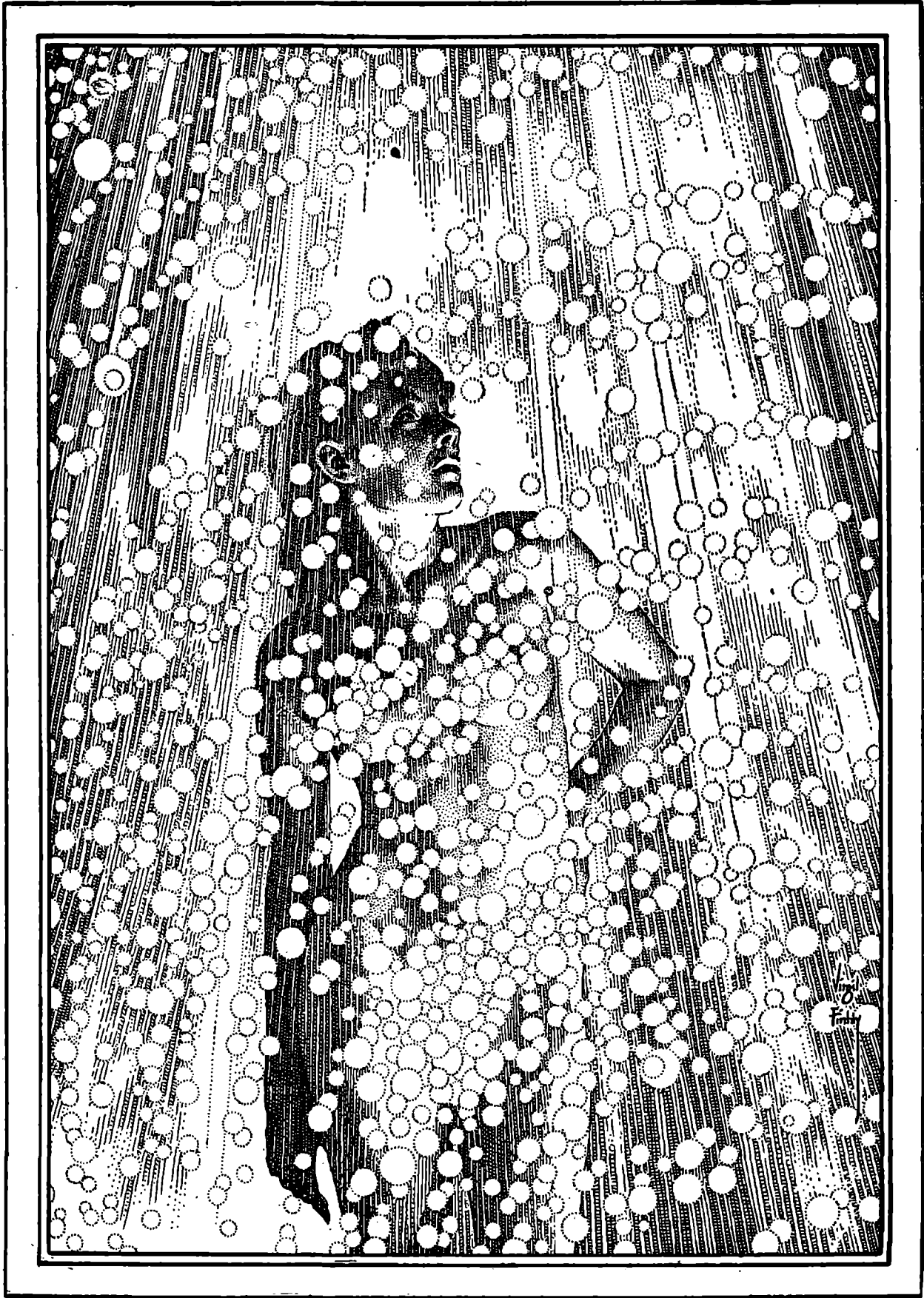
The giantess stared forth, awesome, splendid. . . .