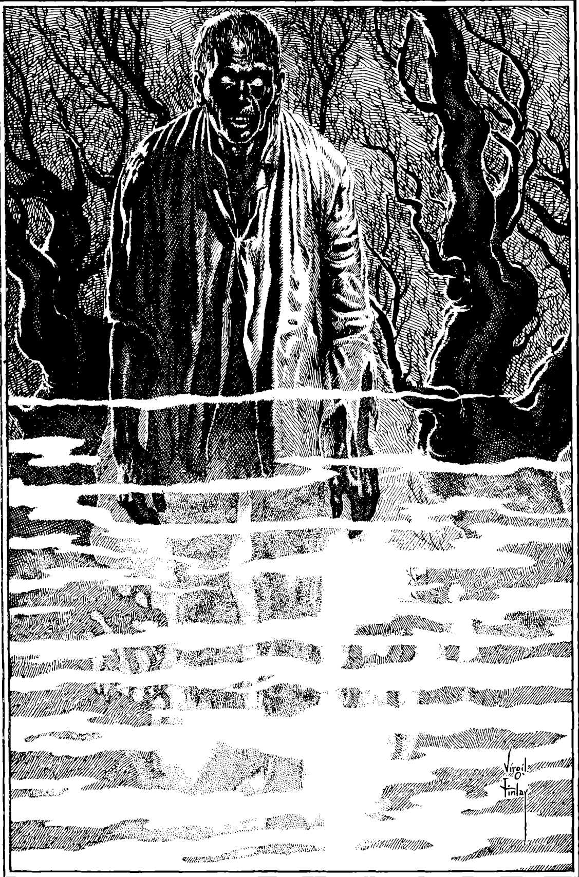
The fingers of a gelid dread tightened on my heart, as I looked upon him who had been dead.