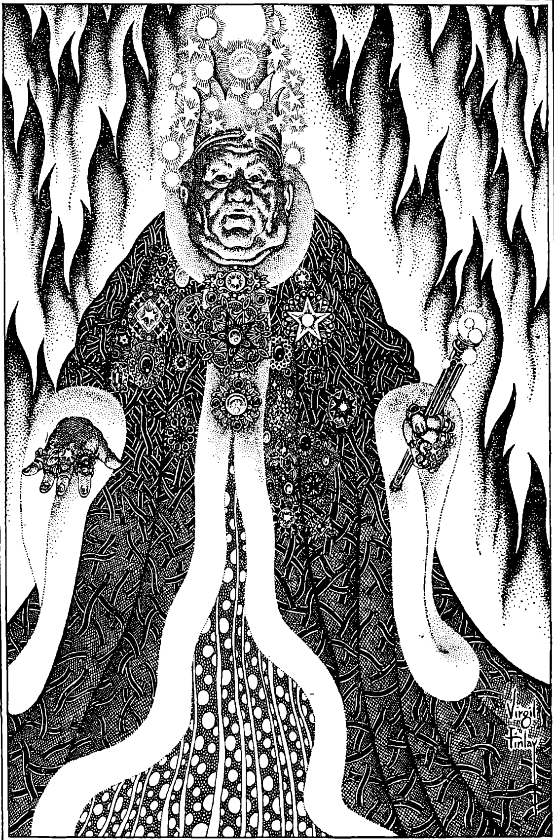
He stood there in the pulsing heat of that living crimson flame.