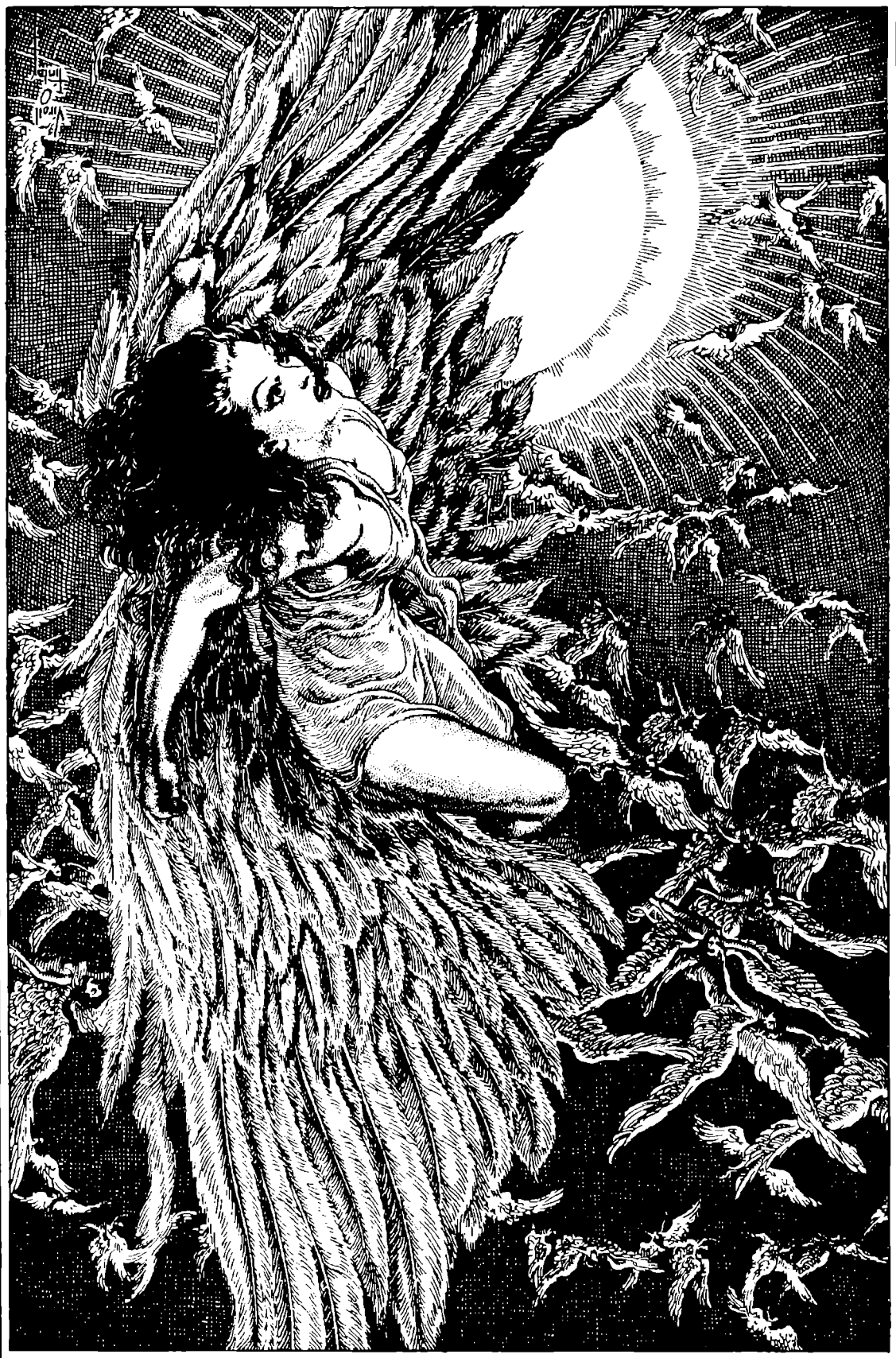
The slender, delicately formed body was contorted, now, in agony.