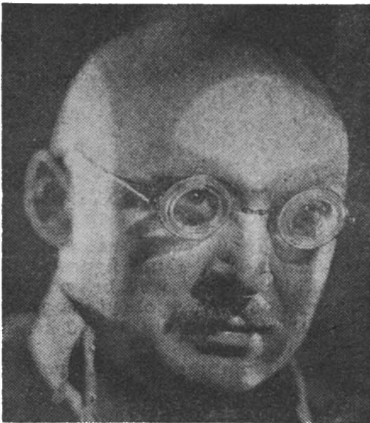
ALBERT DEKKER as DR. CYCLOPS

"Baker found it near the mine shaft. It's uranium ore," he said quietly, "and it's a hundred times richer than any deposit ever discovered. No wonder Thorkel wants to get rid of us!"